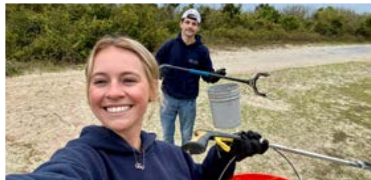
Team members from our South Carolina office cleaned up debris at Folly Beach.