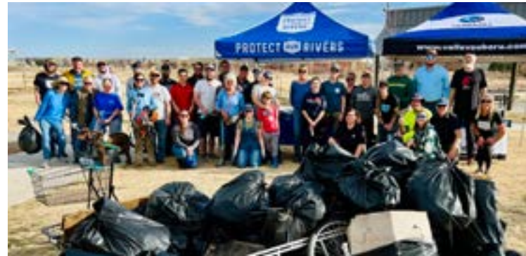
The Colorado office worked with Protect Our Rivers where they picked up trash along St. Vrain Creek.