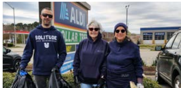
Our Virginia Beach, VA office removed trash from several stormwater ponds throughout the community.