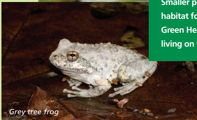
Grey tree frog

Smaller ponds are particularly good habitat for the diminutive but striking Green Heron as it seeks to make a living on frogs and snakes.