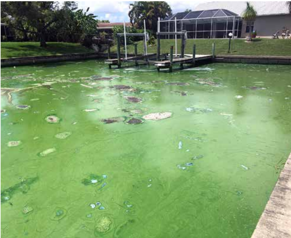
Figure 4. Cyanobacteria bloom.

sulfate and other copper complexes are used at low concentrations (<1 ppm) and are directly toxic to algae. Many of the common cyanobacteria and other nuisance planktonic and filamentous algae are highly susceptible to copper and can be controlled at low concentrations. Some copper complexes, usually chelates, are formulated with surfactants and adjuvants that are designed to keep copper in solution longer and aid in penetrating through the algal cell wall. These stronger formulations are often needed to control mat-forming filamentous algae and other types of macro-algae that resemble higher-level plants. Other commonly used algaecide are peroxides, usually hydrogen peroxide or sodium carbonate peroxyhydrate. Peroxides are generally viewed as having a safer environmental profile, but they are not as broadly effective as copper based products. Again, many of the noxious cyanobacteria are sensitive to peroxide algaecides, allowing for some selectivity in control. The key with any algaecide is treating when nuisance algae is developing, but when densities are still relatively low. Algaecide efficacy is directly linked to algal density. Treating at the beginning stages of an algal bloom will be more effective and