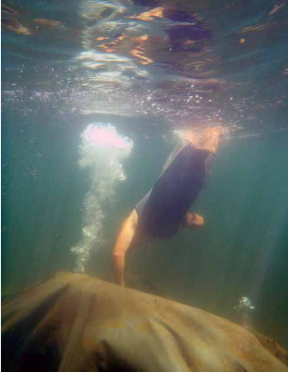
Figure 5. Diver managing benthic barrier (SOLitude Lake Management).

being effectively controlled. Alligatorweed, water hyacinth, water lettuce, giant salvinia and melaleuca are being managed by specific weevils, beetles and flies in Florida and other southern states. Northern tier states have seen some success using weevils and beetles to control Eurasian watermilfoil and purple loosestrife. Most of the successful insect biocontrol programs are overseen by state or university researchers and are not being readily utilized by commercial lake managers. Probably the most effective biocontrol technique is the use of sterile or triploid grass carp (white amur). These fish have a voracious appetite for certain submersed plants. Hydrilla is well controlled by triploid grass carp and they are readily used as a management tool in everything from