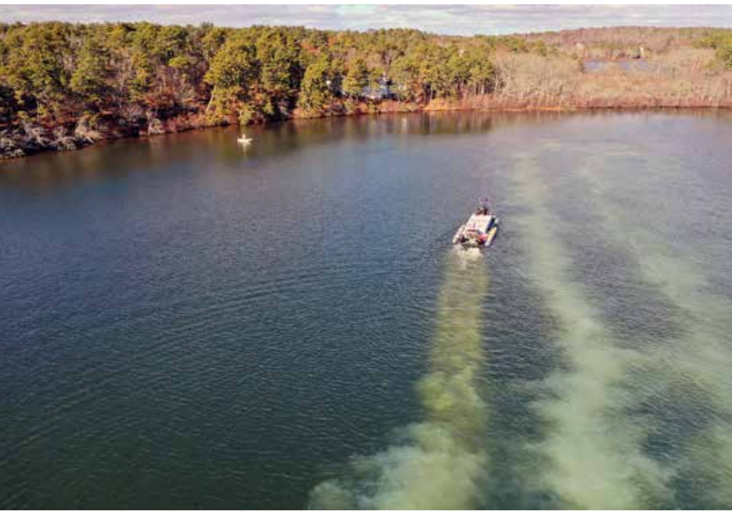
Figure 1. Barge performing aluminum treatment (SOLitude Lake Management).

more readily mixed by wind driven currents. Hypolimnetic aeration and oxygenation systems are usually reserved for deep lakes and reservoirs with specific mixing and oxygenation goals.